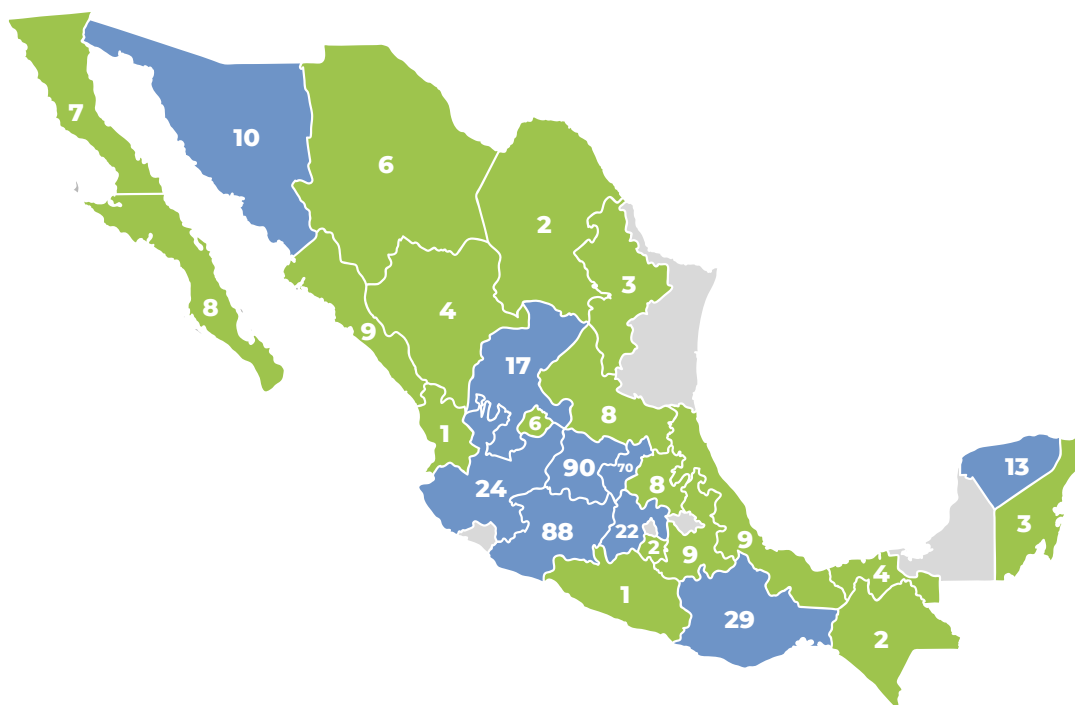
Figure 1. Geographical distribution of the funded projects (Mexico)